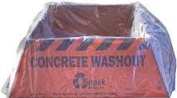
Disposable Wash Out Basin