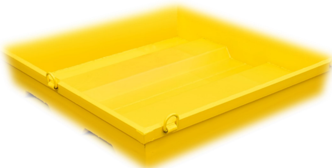
Portable Concrete Wash Out Basin